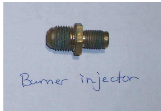
NG A2668 LP A2302