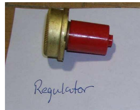
NG A2902 LP A2541