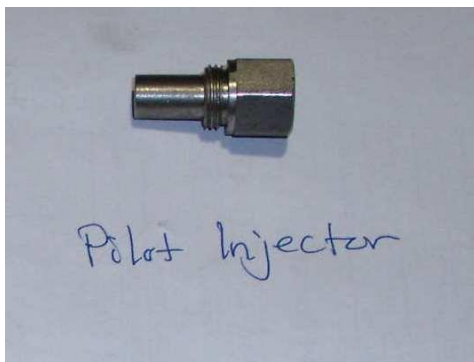
NG A4047 LP A4048