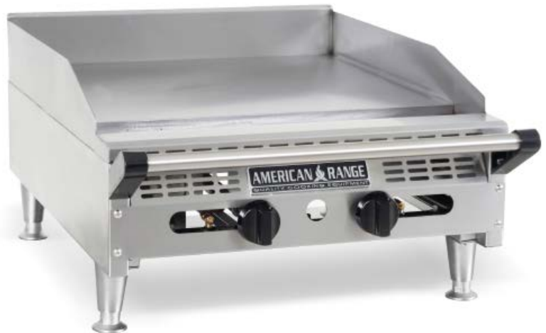
AEMG-24 Shown with standard legs and optional utility bar.