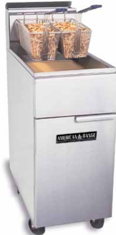
AF35/50 Shown with optional casters